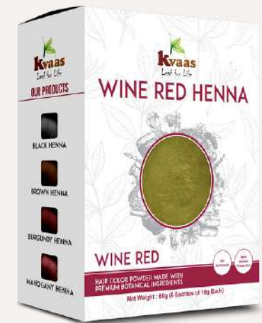
Wine Red Henna