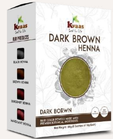
Dark Brown Henna