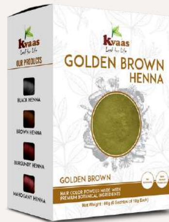
Golden brown Henna