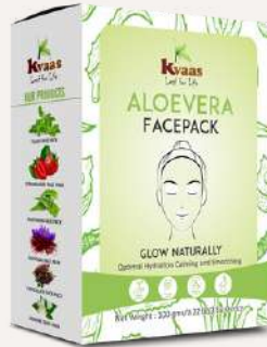
Aloe vera Facepack